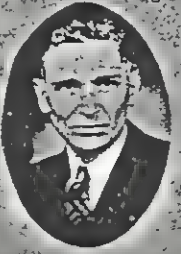
George Warmack Railroad Transportation